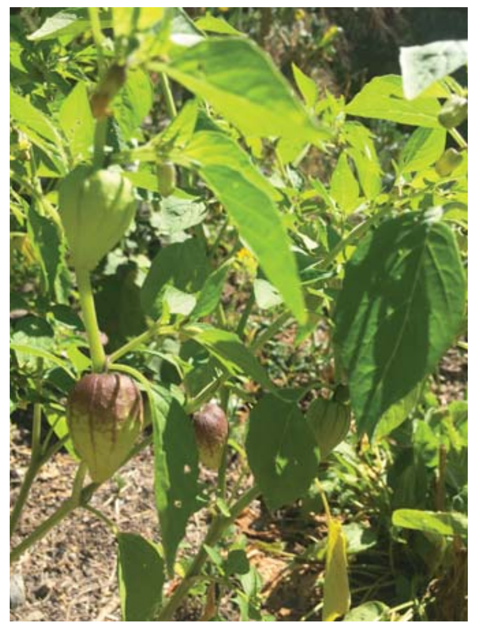
Tomatillos are ready for salsa.

The days are shorter, the nights become longer as we commence the holiday